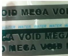
Result after being attacked by peeling in ambient temperature