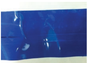
Perfectly sealed condition