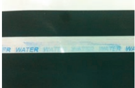
Result after being attacked by liquids such as water, cream, oil, lotion