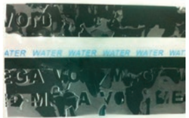
Result after being attacked by Freon/cold spray