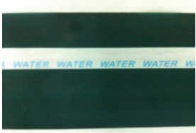
Perfectly sealed condition