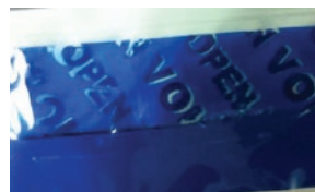
Result of being attacked with heat elements below 70°C